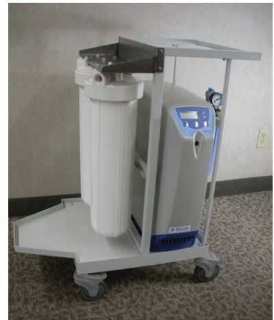
Proposed Cart Design

3. A third option would be to have a service carbon vessel (SCV) in the first position followed by a single carbon block cartridge in the second (polisher) position. This configuration provides for chlorine removal while the components weigh 45% (85 lbs.) less weight than 2 - SCV vessels in series. If leakage of chlorine from the first SCV vessel is detected, testing has demonstrated the carbon block cartridge is capable of removing 3 ppm of chloramine for over 30,800 gallons; so patient care is not compromised. If breakthrough is detected, dialysis can be continued until the spent carbon block is replaced provided there is testing after the second carbon block. Under this condition, if the first SCV vessel is changed before any chlorine breakthrough has been detected, the carbon block could continue to be used; although it may be more practical (recommended) to change both at once.