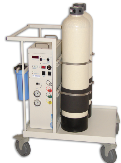
Current Cart Design

In order to determine the efficiency and life of the carbon block technology, MCP set-up a test apparatus that would closely mimic the worse case field conditions that the carbon block would encounter. Once the test environment was established, the operating conditions and product water chemistry needed to be continuously monitored to identify carbon block life and any breakthrough of chloramines.