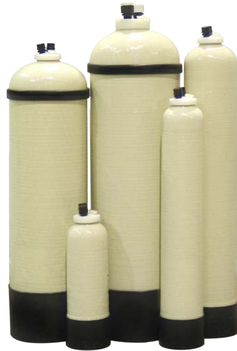
Shown here are our standard tank models from left to right: 420PG, 350PG, 520PG, 360PG and 300PG. Each tank features quick connect fittings for easy installation, service and exchange.