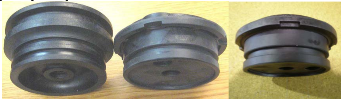
New Style End Cap (From Kit P/N 3025788)