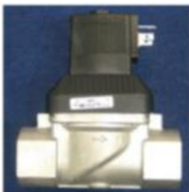
Previous inlet solenoid valve, Burkert 6213 with 8W coil