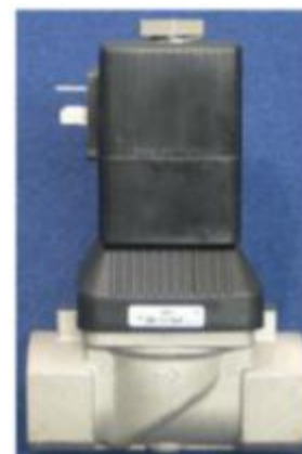
Old inlet solenoid valve, Burkert 6213 with 18W coil